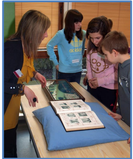
Learning about a local lad's WW1 experience