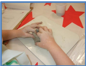
Making a clay pot at Going Potty

An informal fun tour exploring the museum and handle artefacts. In small groups the children be led through the galleries with our experienced staff who will point out objects, answer questions and make connections with everyday objects.