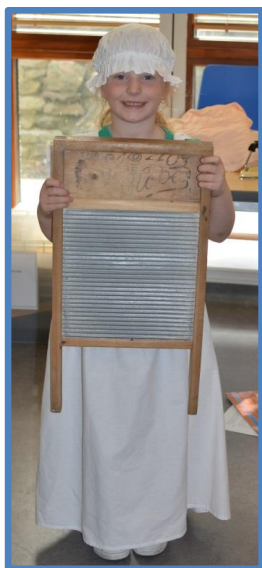
Discovering what washday was like in the past