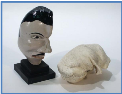
Whale ear drums brought home by whalers

We are also able to offer a whaling artefacts handling session, which takes 20 minutes.